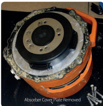
Absorber Cover Plate Removed