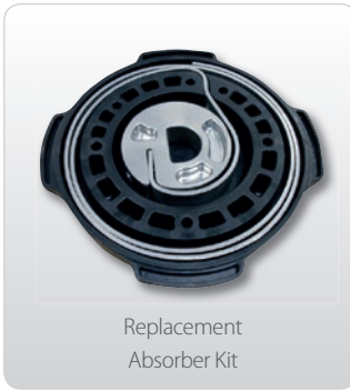
Replacement Absorber Kit