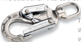
The load indicating stainless steel swivel snap hook

The additional fixtures that are available with the Latchways Sealed SRL include the following: