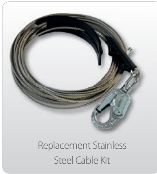
Replacement Stainless Steel Cable Kit