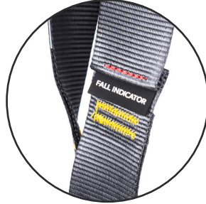
Rip stitch indicators