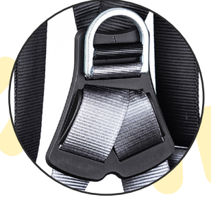
Rear attachment point